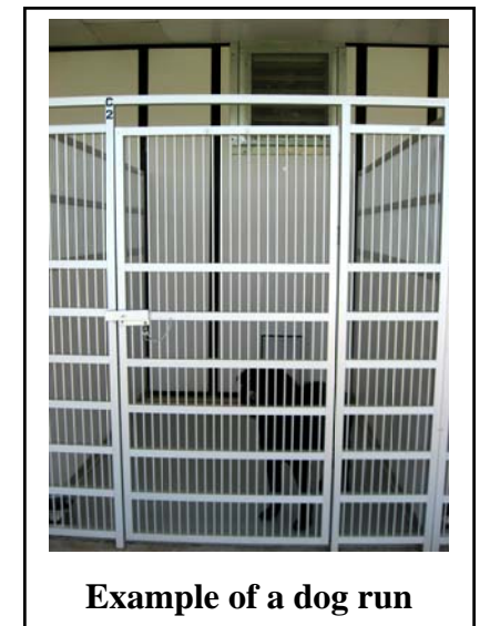
Example of a dog run