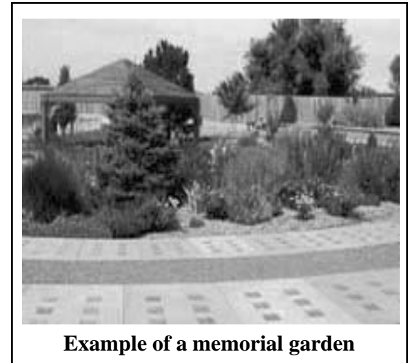
Example of a memorial garden