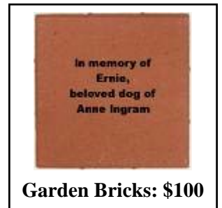
Garden Bricks: $100