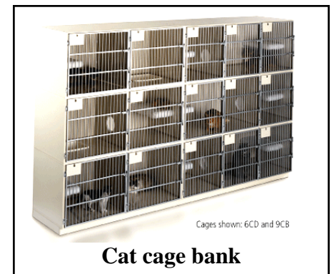
Cat cage bank