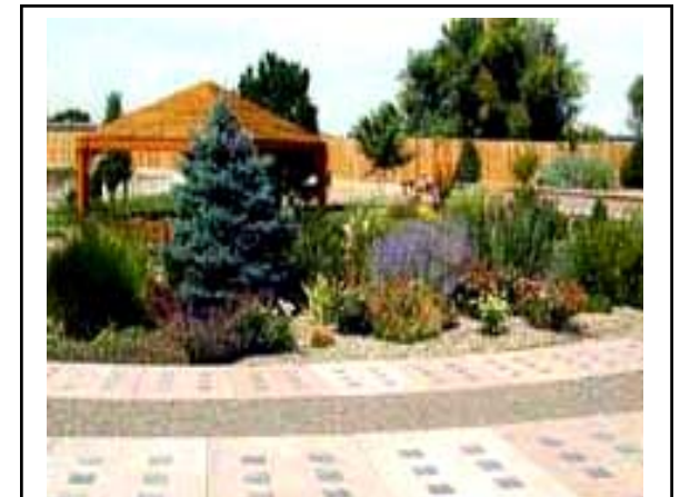
Example of a memorial garden